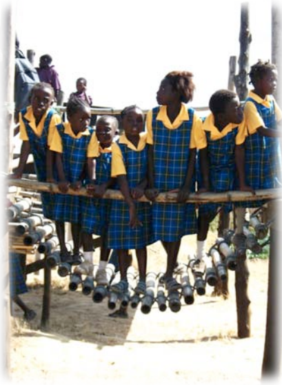
New school uniforms for the students at the MWB academy.