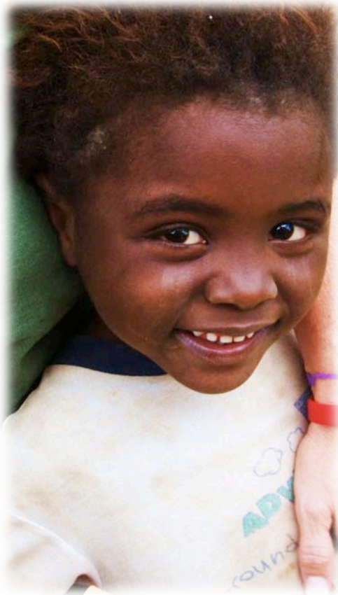
A little girl from "Grandma's house". (Who loved getting her picture taken!)