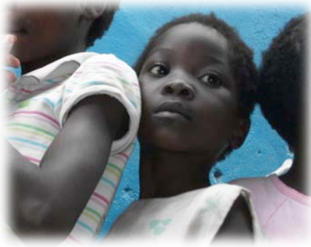
Waiting in line for their school lunch, porridge, at Bwafwano